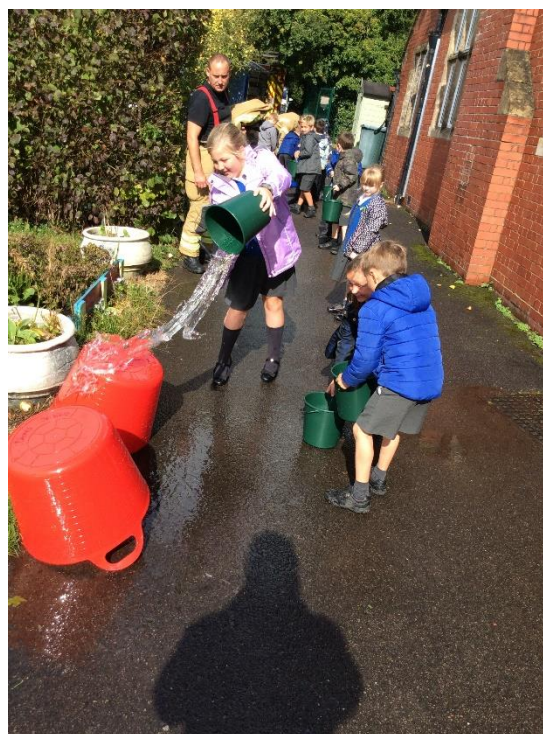
Foxes Class enjoyed their time with The Fire Brigade