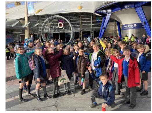
Badgers at the Young Voices concert.